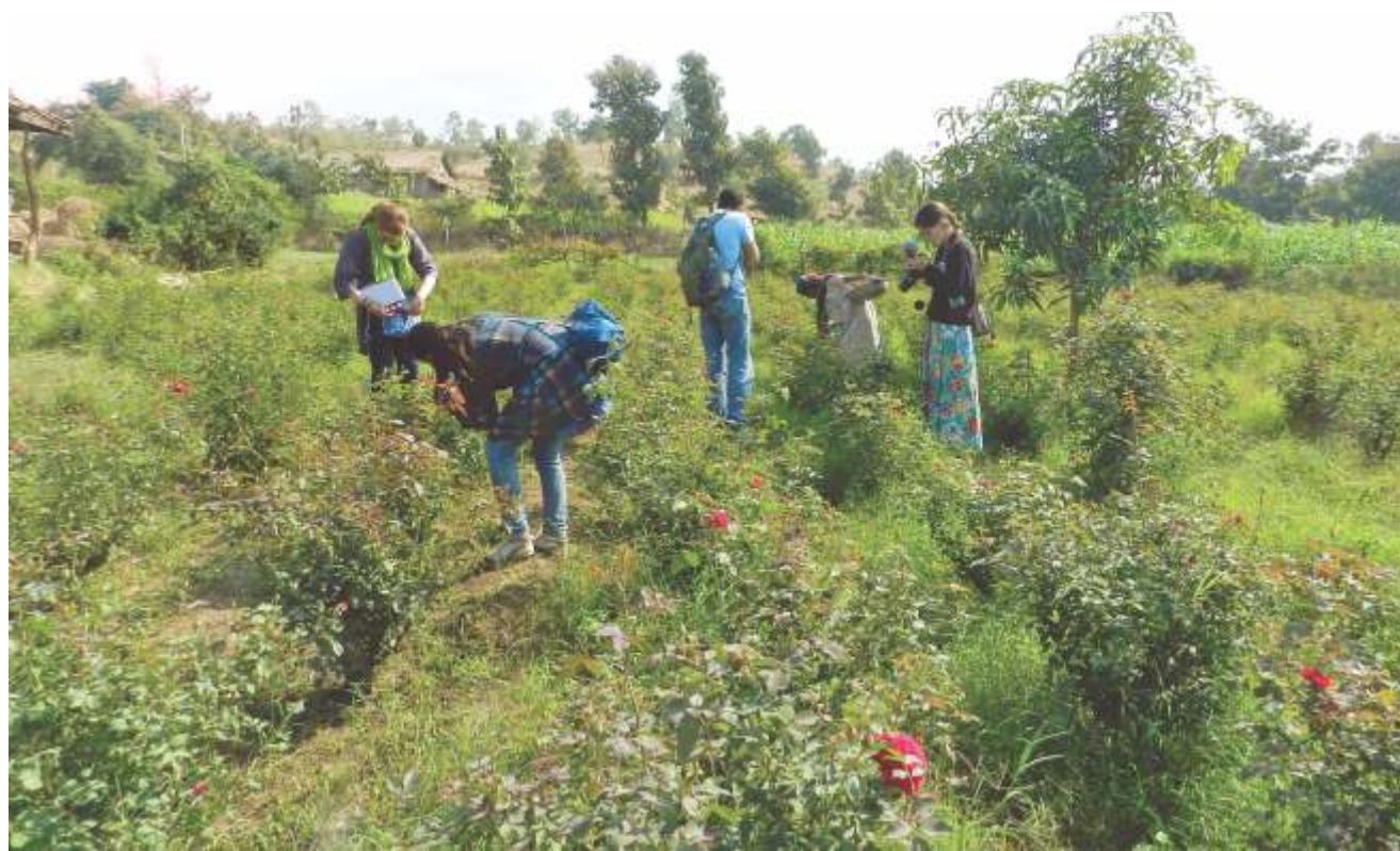
USA Students of Cincinnati University in one of the Rose flowers field at village Kamboi