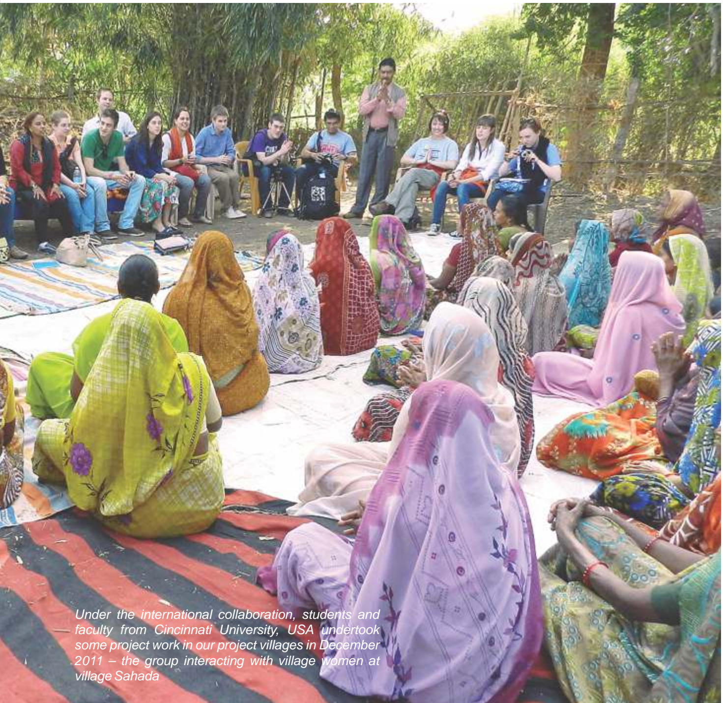
Under the international collaboration, students and faculty from Cincinnati University, USA undertook some project work in our project villages in December 2011 – the group interacting with village women at village Sahada