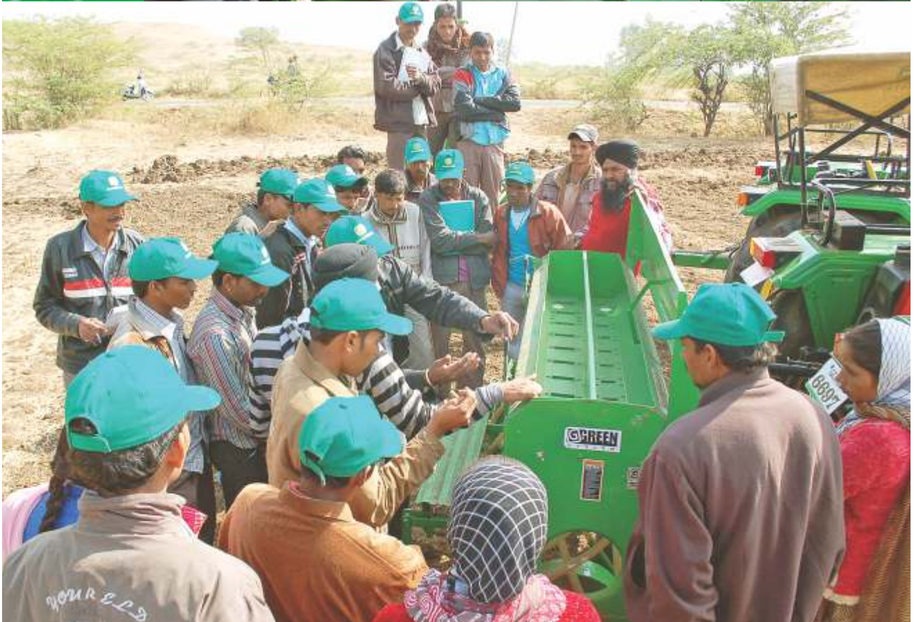
Training programme for Mechanised Agriculture for operation and maintenance of tractors was conducted by the expert staff of John Deere Co. at our training institute.