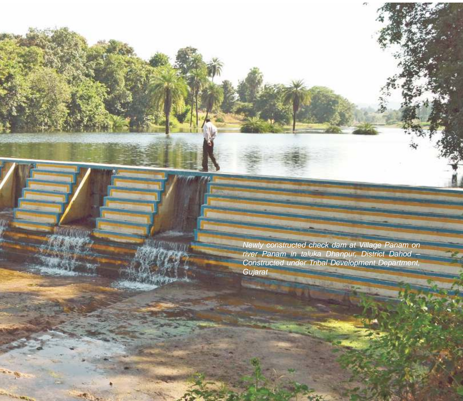
Newly constructed check dam at Village Panam on river Panam in taluka Dhanpur, District Dahod – Constructed under Tribal Development Department, Gujarat

During the reporting year, our serious disappointment was on drinking water front. In previous year, we had implemented 33 household based drinking water projects in Dahod with the support of Department of Tribal Development. Everyone including government and Tribal Department were very much satisfied