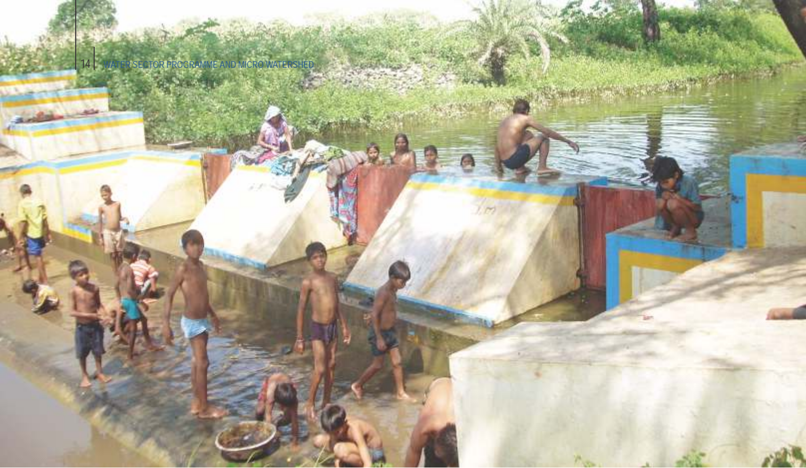
Under the micro watershed development, small masonry check dams are constructed - One such check dam at village Harinagar, Thandla, district Jhabua, Madhya Pradesh - village children taking benefit of this impounded water as earlier this nalla had no water stored after monsoon.

There are large numbers of watershed project villages where such massive convergence with massive additional mobilization of funds has been effected by our organization.