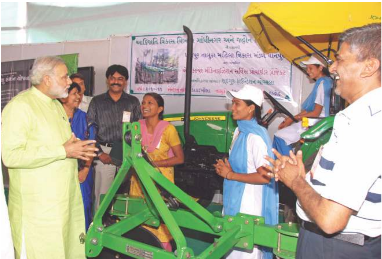
Shri Narendrabhai Modi, Chief Minister, Gujarat during visit to our stall in agriculture exhibition under the event of Swarnim Gujarat interacting in jolly mood with tribal women of our women federation managing Mechanised Agriculture project.

During the reporting year 2011-12, the financial support from the government was to the extent of ` 23.96 crore (say ` twenty four crore). This is very impressive support. It was received for different government programmes in three states that we have been working actively. The above amount constitute 70 % of overall expenditure of our organization during the reporting year.