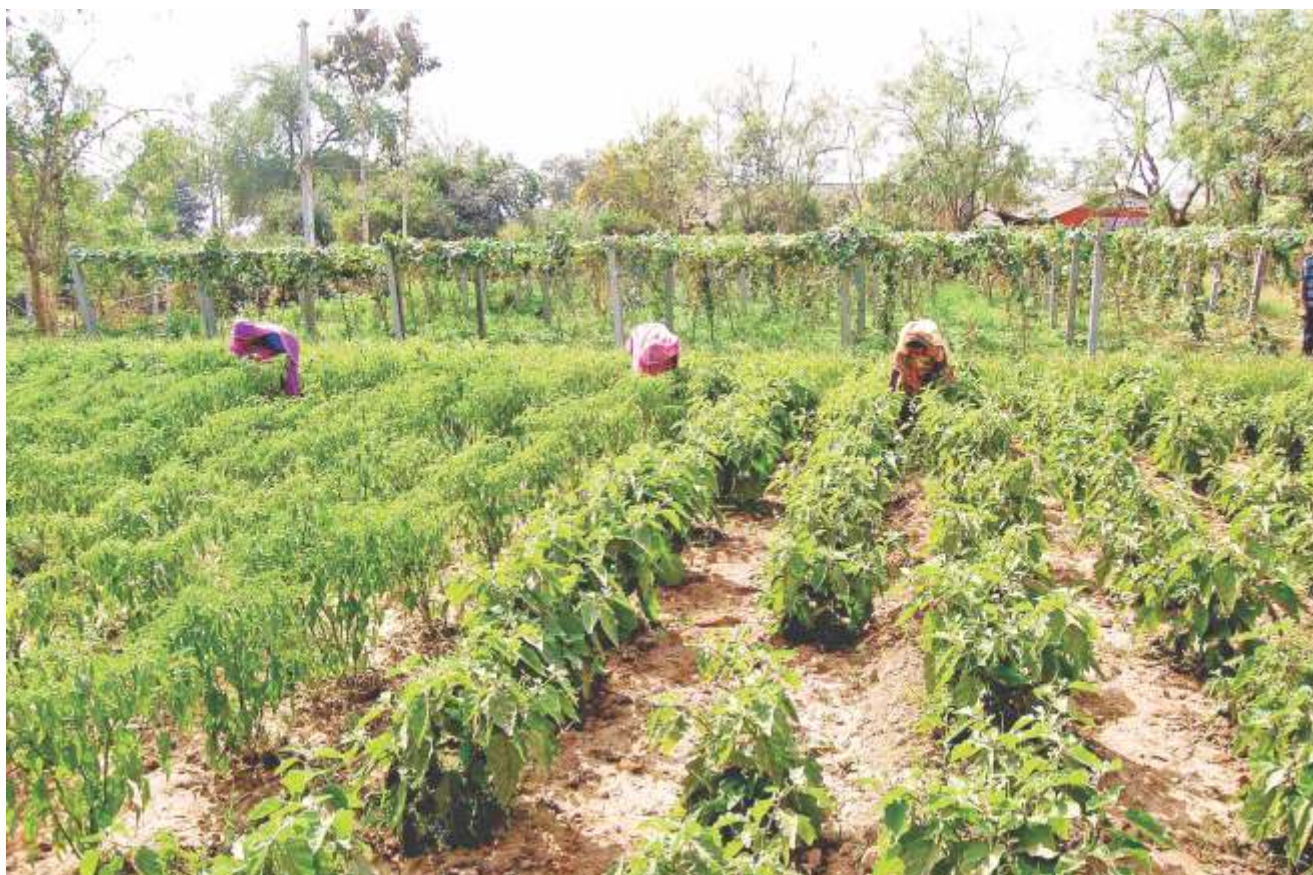
Ramilaben Patel, Dabhada, Limkheda Taluka cultivated Chilly, Brinjal and Creeper vegetable under trellis system and together earned around Rs. 70,000/- in little more than half an acre of the land (25 Guntha) precisely.

This programme is also very popular and highly paying to those who have opted for it. During the reporting period, 1,167 farmers opted for seasonal