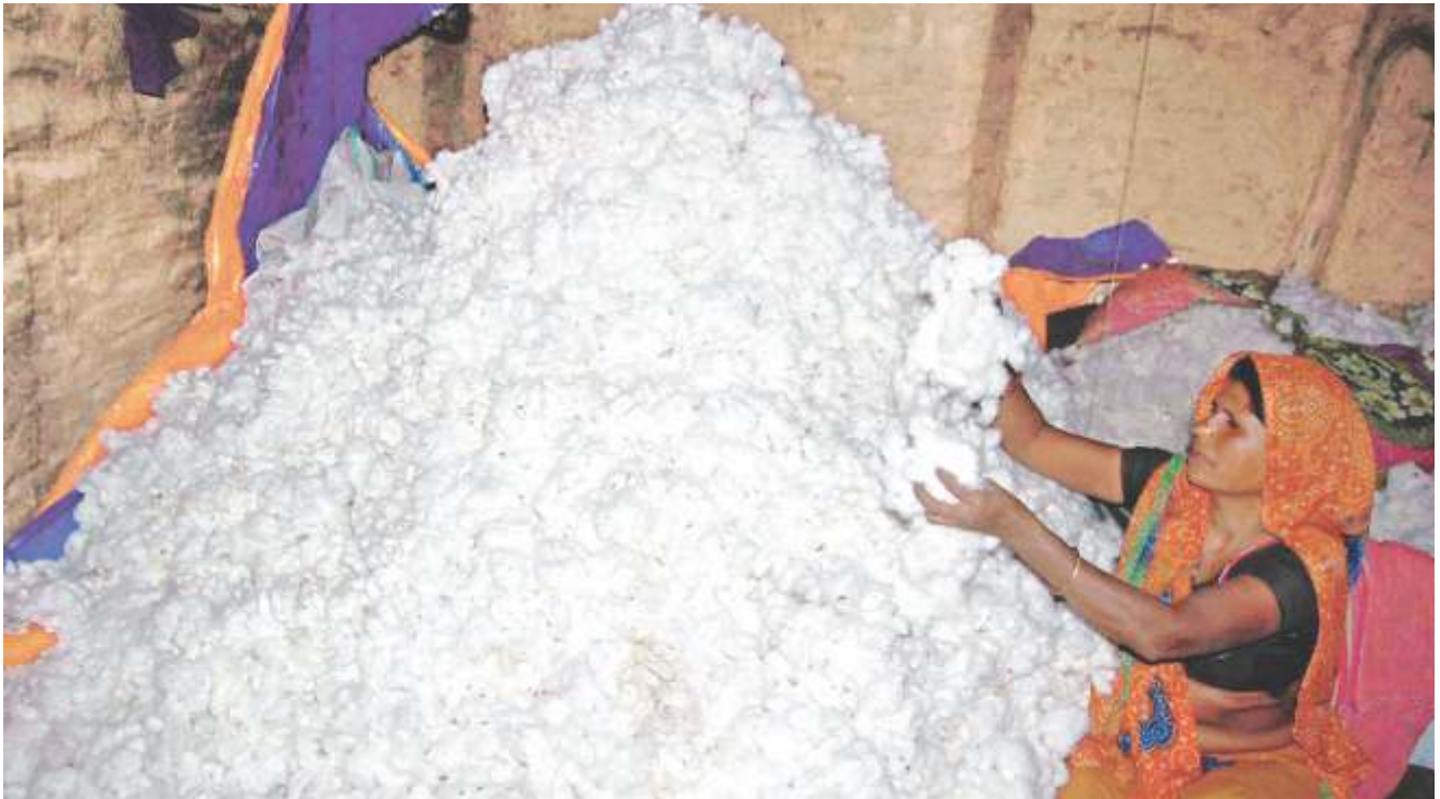
FIRST TIME Bt COTTON CULTIVATION IN DHANPUR TALUKA OF DAHOD, GUJARAT

We implemented some important programmes under the title SUNSHINE programme of Department of Tribal Development, Gujarat, during the reporting period. Under this programme, Monsanto - Prabal variety of Maize was cultivated by 6,913 farmers in the equal numbers of acres during Kharif 2011 in Dhanpur taluka. Another programme undertaken was Bt Cotton by 500 farmers in 500 acres. Third programme was of improved Pigeon Pea by 500 farmers in 500 acres. Thus, totally, 7,913 farmers were involved in Sunshine programme in the year 2011.