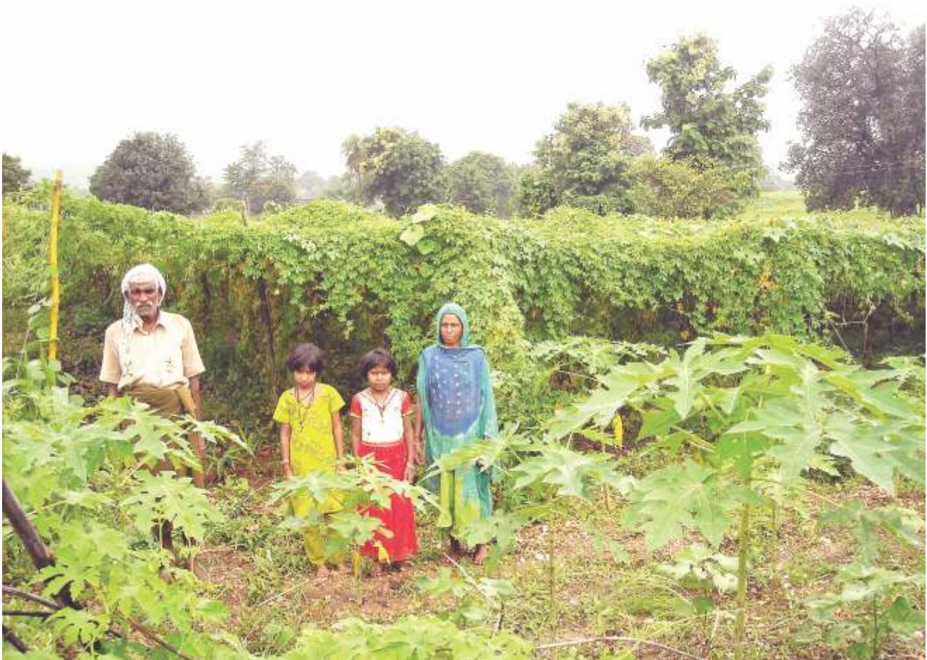
Cost effective Bamboo trellis system for vegetable cultivation at village Dumka, Taluka Dhanpur under NABARD Organic Wadi Programme. Every day or alternate day farmers earn ` 700/- under this system of vegetable cultivation. Farmers opting for this system for vegetable cultivation usually earn ` 50,000/- to ` 75,000/- on 1/4 th of an acre.

As reported earlier, the creeper vegetable production is much better, qualitatively and quantitatively under trellis system. During reporting period with the support of different agencies such as the government, Department of Tribal Development, Department of Agriculture and Horticulture, NABARD, as many as 1,075 trellis systems were installed in Dahod. Totally and cumulatively, there are 1,871 trellis system for creeper vegetables. This is extremely paying system under which each farmer raising vegetable on 1/4 th an acre gets anything between ` 40,000/- to ` 75,000/- as per field reports and observation. Considering average income of ` 45,000/- per trellis the total income of farmers from above trellis would be more than ` 8 crore in one season / year.