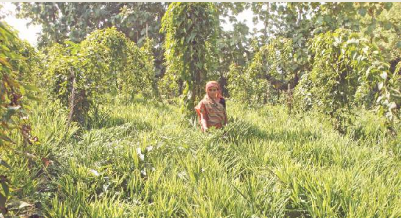
Ginger as inter cultivation under NABARD Programme at village Nani Vav, Taluka Limkheda

1,000 Square meters) cultivation of Ginger under above programme. As often happens, at the time of harvesting, prices of agriculture crops slump down. This time, Ginger prices have also slumped down. To counter this situation, large numbers of farmers have decided to retain the product and sell it as seeds in April - May which would get them good rates.