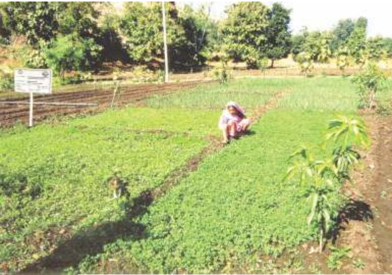
New wadi – orchard – at village Mander, Taluka Limkheda, district Dahod with inter cultivation of different vegetables, Onion, Garlic, Fenugreek, Coriander during gestation period under the programme of NABARD, Gujarat