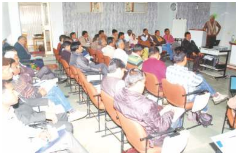
SDTT partners workshop at the Sadguru Foundation, Chosala on 9-11 December 2011 – Field visits to Sadguru's NRM programme was an important component of this workshop.

"We highly appreciate your work on water resources management projects specially lift irrigation schemes and water harvesting structures and involvement and empowerment of local communities in the process. Organizations like yours and we are working on similar issues but in different geographical and cultural boundaries,