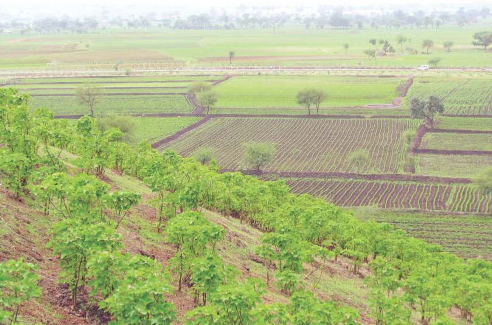
Treated area under RGM Watershed Project at Village Parvaliya, Jhabua, Madhya Pradesh