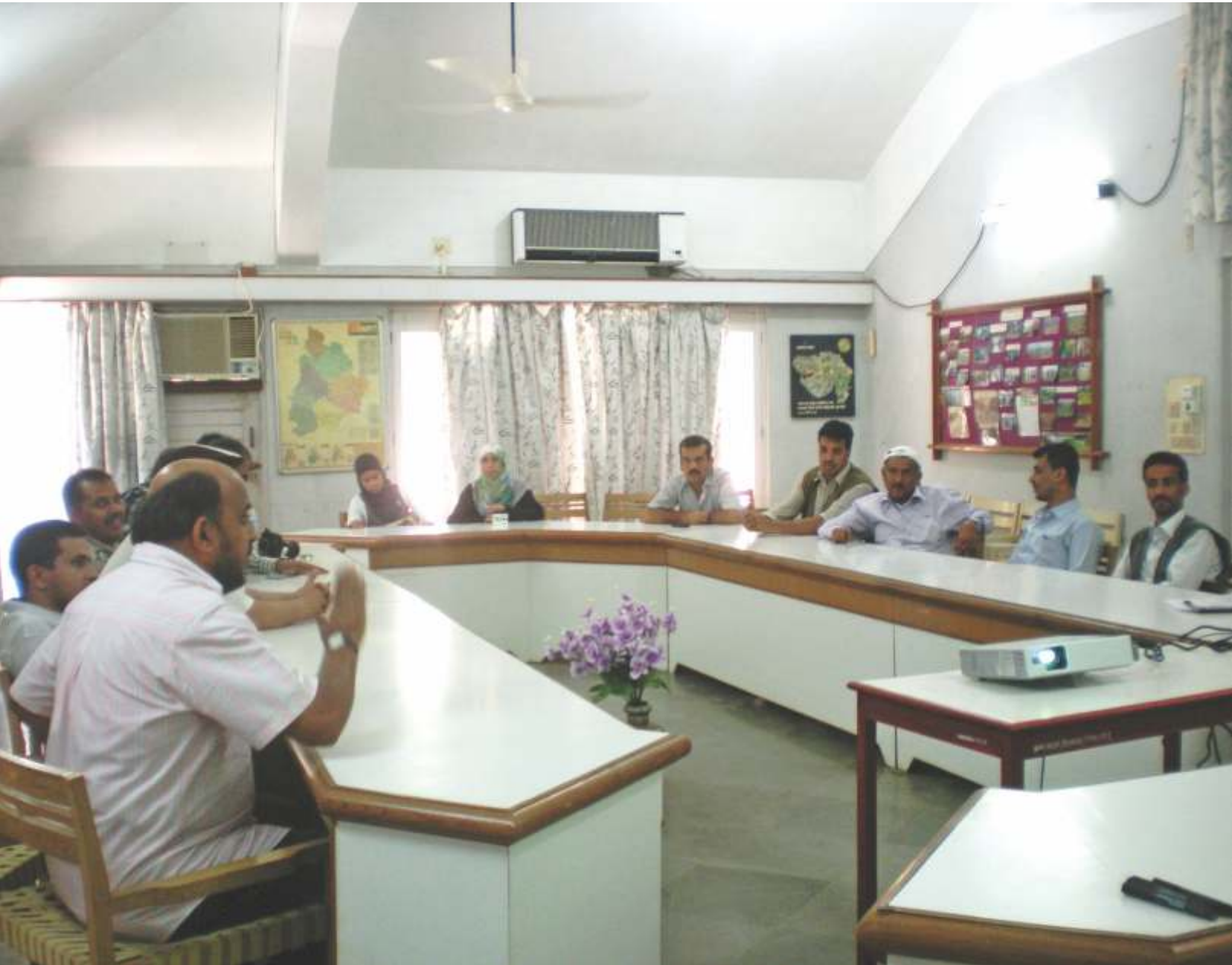
Delegation from Yemen visiting our organisation for exposure to our NRM model, as a part of their training programme at IRMA, Anand