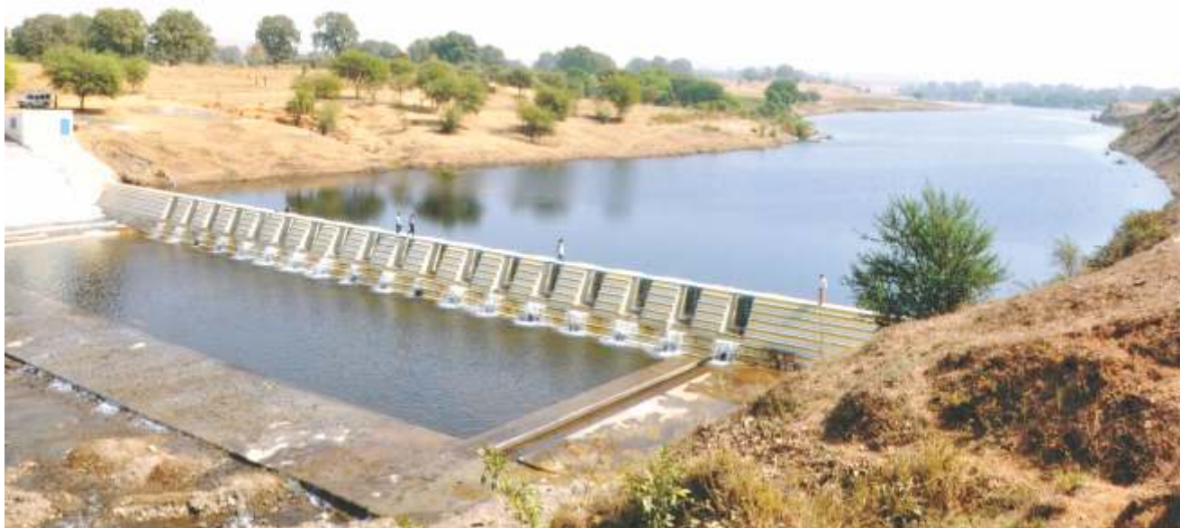
Newly constructed check dam at Village Simlaghasi on river Panam in taluka Devgad Baria, District Dahod – Constructed under Tribal Sub Plan

with the installation and functioning of these drinking water systems. We were assured to get adequate amount for the expansion of this programme during reporting year, and infact, sufficient amount was given by the Department of Tribal Development to line department for the projects to be implemented by our organization. We did not get any amount. WASMO, the organization, working for drinking water and sanitation had also assured to support our programme of drinking water. This also did not materialize. It appears at local level, some elements are not interested in entrusting the work to our organization, inspite of our good record.