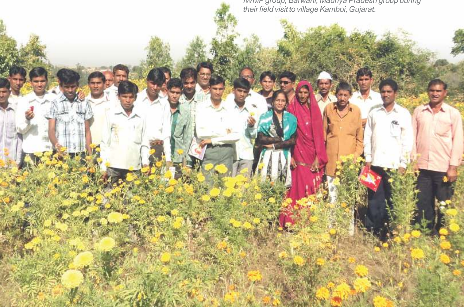
IWMP group, Barwani, Madhya Pradesh group during their field visit to village Kamboi, Gujarat.

"Lift irrigation scheme and its participatory management by people of Pali village of Limkheda taluka is marvelous. Approach and contribution of Sadguru for development of farmers is quite praiseworthy. Visit of Dabhda, Kamboi and Rozam villages was useful to our team members as we