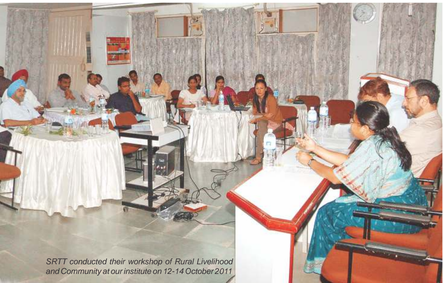
SRTT conducted their workshop of Rural Livelihood and Community at our institute on 12-14 October 2011