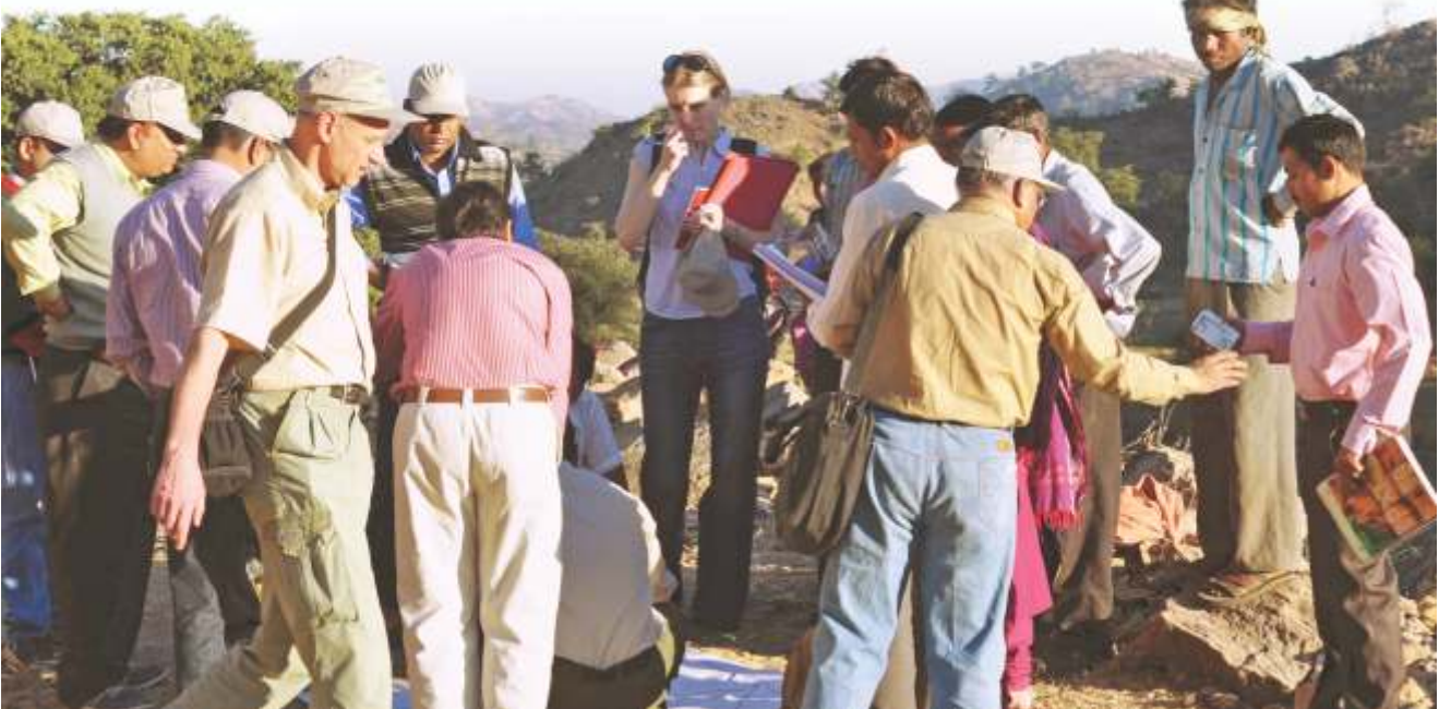
A review mission from KFW, Germany, visiting Indo-German watershed project of NABARD Khunta-III, district Banswara, Rajasthan on 11-12-2011

Sadguru Foundation is one such NGO which has achieved maximum convergence in its watershed development and other programmes. Interestingly, the major funds for the convergence were availed from different departments of the government.